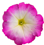
Rose Morn PH0211P