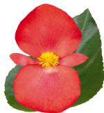
Red Green Leaf BB0202P