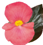
Rose Bronze Leaf BB0205P