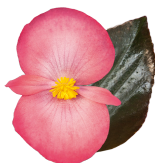
Salmon Bronze Leaf BB0209P