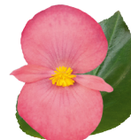
Rose Green Leaf BB0201P