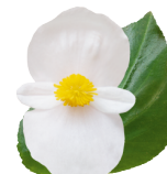
White Green Leaf BB0207P