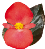
Red Bronze Leaf BB0206P