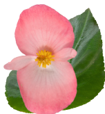
Pink Green Leaf BB0203P