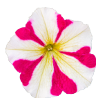
Rose Star PH0208P