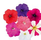
Maxi Mix PH0299P