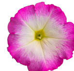
Rose Morn PH0211P