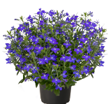
Blue with Eye LE0201P