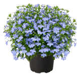
Sky Blue LE0202P