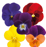
Indian Summer Mix VC0194E