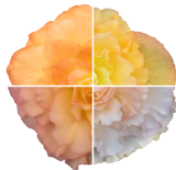
Peach Shades BT0416P