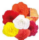
Select Mix BT0496P