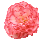
Rose Picotee BT0410P