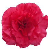
Deep Rose BT0411P