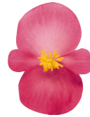
Deep Rose BS0904P