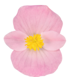
Brandy ® BS0802P