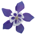
Blue & White AH0101R