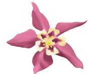
Rose & Ivory AH0106R