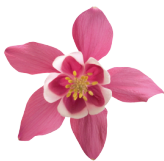
Rose & White AH0105R