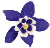
Navy & White AH0102R