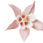
Pink & White AH0104R