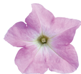
Light Pink PH0404P