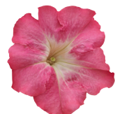
Salmon Morn PH0409P