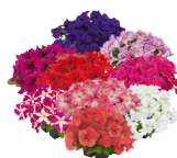
Maxi Mix PH0499P