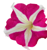
Rose Star PH0407P