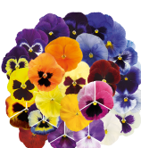
Maxi Mix VW0299R/E