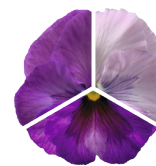
Lavender Blotch Shades VW0205R/E