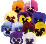
Blotch Mix VW0288R/E