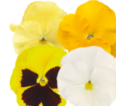
Limoncello Mix VW0294E