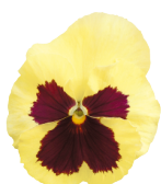
Lemon Blotch VW0204R/E