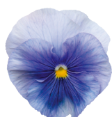
Light Blue VW0218R/E