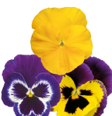
Mardi Gras Mix VW0296E