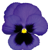
Blue Blotch VW0202R/E