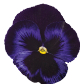
Blue Velvet VW0203R/E