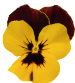
Yellow Red Wing IMPROVED VW0703R/E