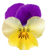
Yellow Purple Wing VW0704R/E