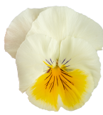
Lemon Splash VW0706R/E