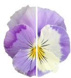
Light Violet Shades VW0705R/E