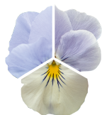
Blue Heaven VW0707R/E