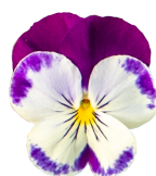
Violet Face VW0708R/E