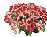
Red Star PH0512R/P