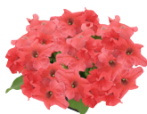
Deep Salmon PH0502R/P