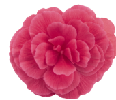
Pink Shades BT0507P