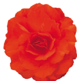
Deep Orange BT0503P