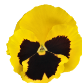
Yellow Blotch VW0207R/E