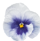
Metallic Blue Blotch VW0219R/E