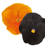
Jack-o-Lantern Mix VW0290E