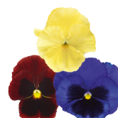
Wine Country Mix VW0291E