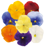
Clear Mix VW0289R/E