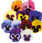
Blotch Mix VW0288R/E