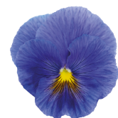
True Blue VW0210R/E