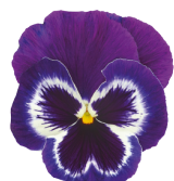
Violet Face VW0216R/E