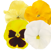
Limoncello Mix VW0294E