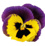
Yellow Purple Wing VW0211R/E