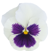
White Blotch VW0217R/E