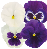
Blueberry Pie Mix VW0293E