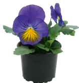
Blue & Yellow VW0404R/E