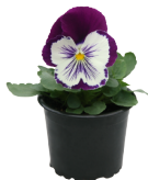
Purple & White VW0405R/E