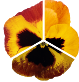
Fire Surprise VW0223R/E