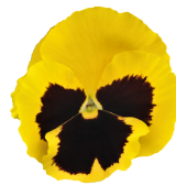
Yellow Blotch VW0207R/E