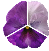
Lavender Blotch Shades VW0205R/E