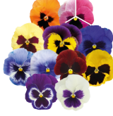
Blotch Mix VW0288R/E