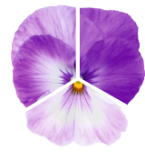
Marina Lavender VW0226R/E