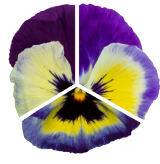
Blueberry Lemon VW0228R/E