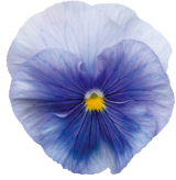
Light Blue VW0218R/E