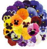
Maxi Mix VW0299R/E