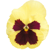
Lemon Blotch VW0204R/E