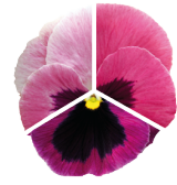
Pink Shades VW0220R/E