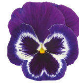
Violet Face VW0216R/E