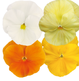
Sunny Day Mix VW0297E