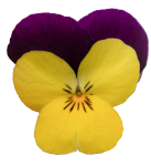
Limoncello Purple Wing VC0131R/E