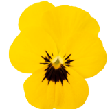
Yellow Blotch VC0116R/E