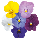
Clear Mix VC0192R/E