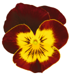
Red Yellow Face VC0121R/E