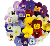
Maxi Mix VC0199R/E