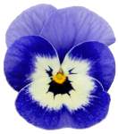
Deep Marina VC0106R/E