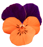
Orange Purple Wing IMP VC0118R/E