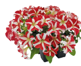
Red Star PH0512R/P