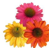
Golden Summer Mix EP2198T