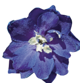
King Arthur DH0104R