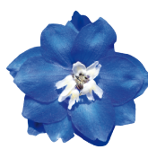
Blue Bird DH0106R