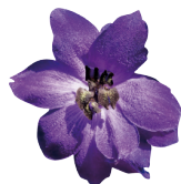
Black Knight DH0101R