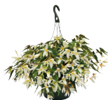
Santa Barbara BB5003P