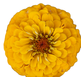
Golden Yellow ZE0201R