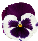
White Violet Wing VW0609R/E