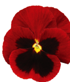
Red Blotch VW0605R/E