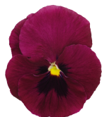
Deep Rose Blotch VW0607R/E