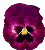
Rose Velour VW0608R/E