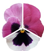
Pink Surprise Blotch VW0606R/E