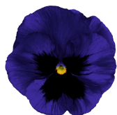
Deep Blue Blotch VW0602R/E