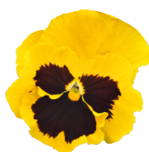
Yellow Blotch VW0613R/E