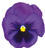
Blue Surprise VW0601R/E