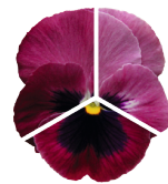
Light Rose Blotch VW0614R/E