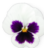
White Blotch VW0611R/E