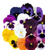
Maxi Mix VW0699R/E