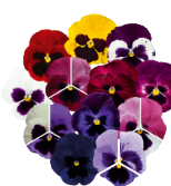
Blotch Mix VW0698R/E