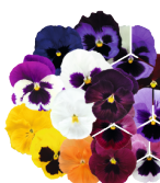
Maxi Mix VW0699R/E