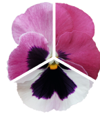
Pink Surprise Blotch VW0606R/E