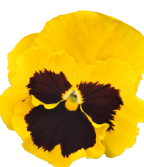
Yellow Blotch VW0613R/E