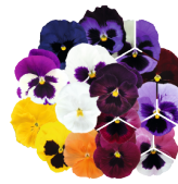
Maxi Mix VW0699R/E