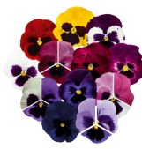
Blotch Mix VW0698R/E