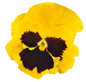
Yellow Blotch VW0613R/E