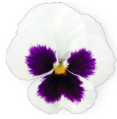
White Blotch VW0611R/E