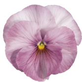
Lilac Shades VW0101R/E