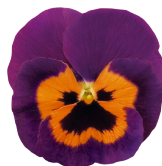
Purple & Orange VW0104R/E