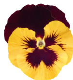
Yellow Red Wing VW0103R/E