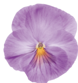
Lavender Pink VW0107R/E