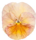
Peach Shades VW0102R/E