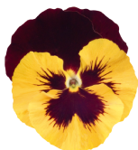
Yellow Red Wing VW0103R/E