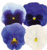
Summer Skies Mix VW0292E