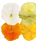
Sunny Day Mix VW0297E