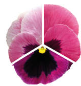
Pink Shades VW0220R/E