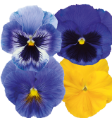
Sun'n Surf Mix VW0298E