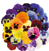
Maxi Mix VW0299R/E