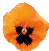
Orange Blotch VW0213R/E