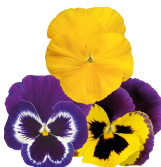
Mardi Gras Mix VW0296E