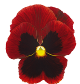
Red Blotch VW0215R/E