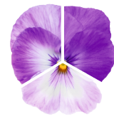
Marina Lavender VW0226R/E