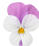
White Pink Wing VC0128R/E