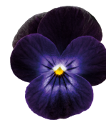
Deep Purple Face VC0105R/E