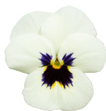
Ivory Blotch VC0133R/E