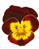
Red Yellow Face VC0121R/E