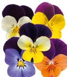
Jump Up Mix VC0195E