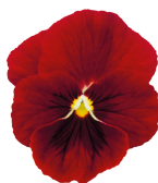
Red Blotch VC0111R/E