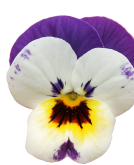
Jolly® Face VC0103R/E