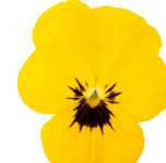
Yellow Blotch VC0116R/E