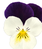
White Purple Wing VC0114R/E