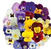
Maxi Mix VC0199R/E