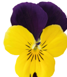
Yellow Purple Wing VC0117R/E