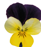
Lemon Purple Wing VC0108R/E