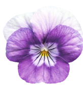
Lavender Pink Face VC0132R/E