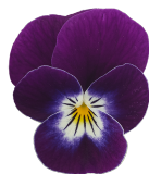
Purple White Face VC0112R/E