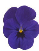
Deep Blue VC0104R/E