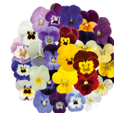
Maxi Mix VC0199R/E