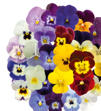
Maxi Mix VC0199R/E