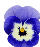
Deep Marina VC0106R/E