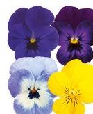
California Mix VC0197E