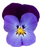
Neon Purple Wing VC0101R/E