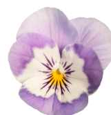
Pink Surprise VC0109R/E