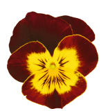
Red Yellow Face VC0121R/E