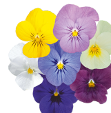
Clear Mix VC0192R/E