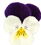
White Purple Wing VC0114R/E