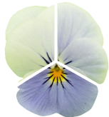
Blue Heaven VC0124R/E