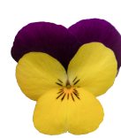
Limoncello Purple Wing VC0131R/E