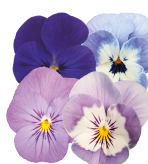
Blackberry Mix VC0198E