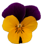
Apricot Purple Wing VC0122R/E