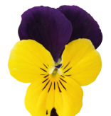
Yellow Purple Wing VC0117R/E