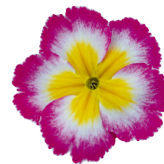
Rose Bicolor PE1109R