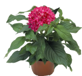
Deep Rose PL0203P