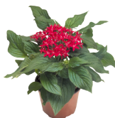
Deep Red PL0206P