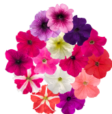
Maxi Mix PH0599R/P