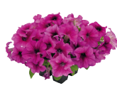
Burgundy Vein PH0510R/P