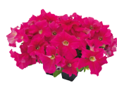
Deep Pink PH0513R/P