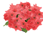
Deep Salmon PH0502R/P