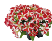
Red Star PH0512R/P