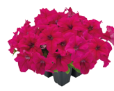
Deep Rose PH0504R/P