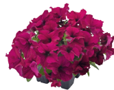
Burgundy IMPROVED PH0508R/P