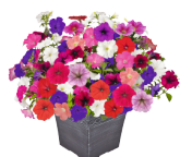
Maxi Mix PH0199P