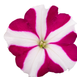
Magenta Star PH0115P