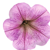
Silver Vein PH0101P