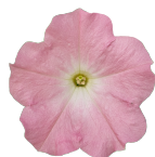
Light Pink Morn PH0118P