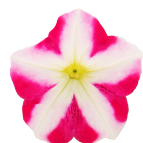
Rose Star PH0116P