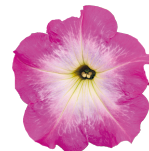
Pink Morn PH0114P