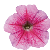
Strawberry Ice PH0320R/P