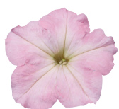
Chiffon Morn PH0307R/P