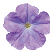
Sky Blue PH0319R/P