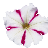
Burgundy Star PH0305R/P