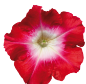
Red Morn PH0315R/P