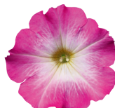
Pink Morn PH0312R/P