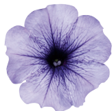
Blue Ice PH0302R/P