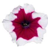
Burgundy Frost PH0304R/P