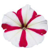
Rose Star PH0317R/P