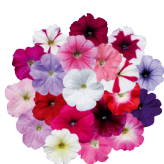
Regular Mix PH0399R/P