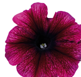
Plum Ice PH0313R/P