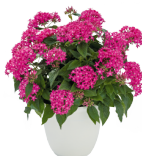
True Pink PL0407P