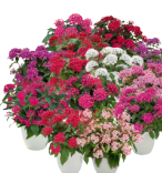
Maxi Mix PL0499P