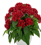
Deep Red PL0413P