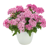
Flirty Pink PL0403P