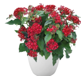
Red Velvet PL0422P