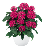
Bright Red PL0419P