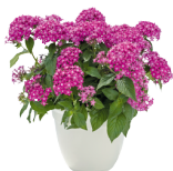
Lavender Pink PL0412P