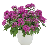
Ultra Violet PL0410P