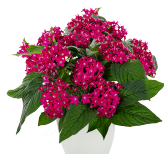
Neon Plum PL0415P