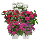
Selected Mix PL0498P