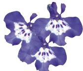
Blue with Eye LE0102R/U