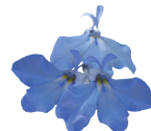
Sky Blue LE0105R/U