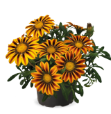
Orange Flame GR0102C