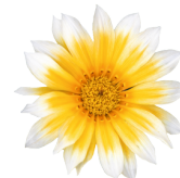
Sunny-Side Up GR0106C