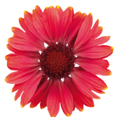
Red Shades GA0103C