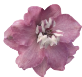
Cherry Blossom White Bee