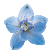
Sky Blue White Bee