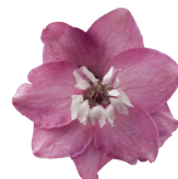
Lilac Pink White Bee