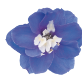
Mid Blue White Bee