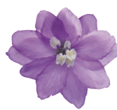
Lavender White Bee