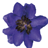
Dark Blue Dark Bee