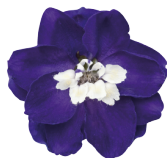
Dark Blue White Bee