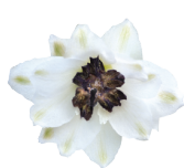
White Dark Bee