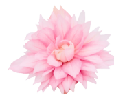
Light Pink BT0701P