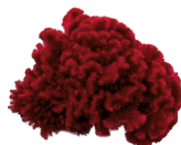
Raven Red CC4003R