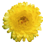
Light Yellow CO0103R