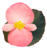
Pink Bronze Leaf BB0105P