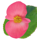
Deep Pink Green Leaf BB0113P