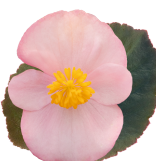
Soft Pink Bronze Leaf BB0115P