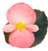
Pink Bronze Leaf BB0105P