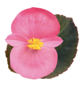
Rose Bronze Leaf BB0109P