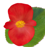
Red Green Leaf BB0106P