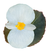
White Bronze Leaf BB0112P