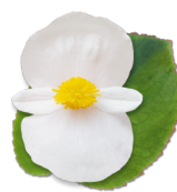
White Green Leaf C4001P