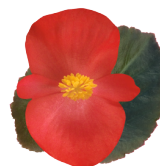
Red Bronze Leaf BB0110P