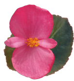
Deep Rose Bronze Leaf BB0108P