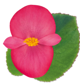
Rose Green Leaf BB0107P