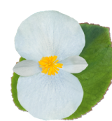
White Green Leaf BB0114P