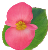
Deep Pink Green Leaf BB0113P