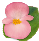
Pink Green Leaf BB0103P