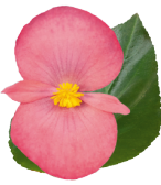
Rose Green Leaf BB0201P