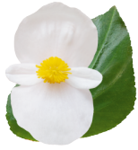
White Green Leaf BB0207P