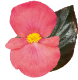
Rose Bronze Leaf BB0205P