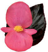
Rose Espresso BB0210P