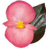
Salmon Bronze Leaf BB0209P