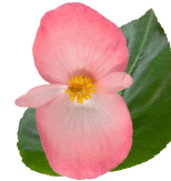
Pink Green Leaf BB0203P